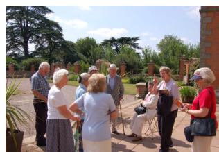
Members at Hanbury Hall with the Volunteer Guide.

In July a party of members visited Hanbury Hall, near Droitwich. We had an excellent guided tour of the House given by one of Hanbury's volunteers. Afterwards members were able to visit the gardens including the newly restored Knot Garden.